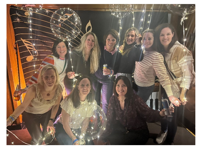
SAVE DATE - February 1st Dueling Pianos - Part 2!

• In early February, we hosted a "Sold Out" Dueling Pianos party in Briody Hall. Many thanks to all who attended!